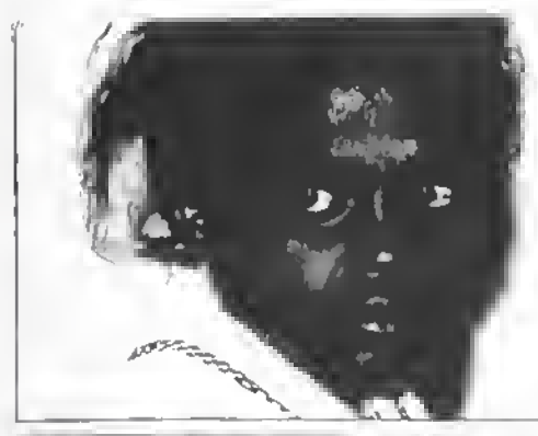
Hildoplan Jewish Children in the Abstract of the rates.